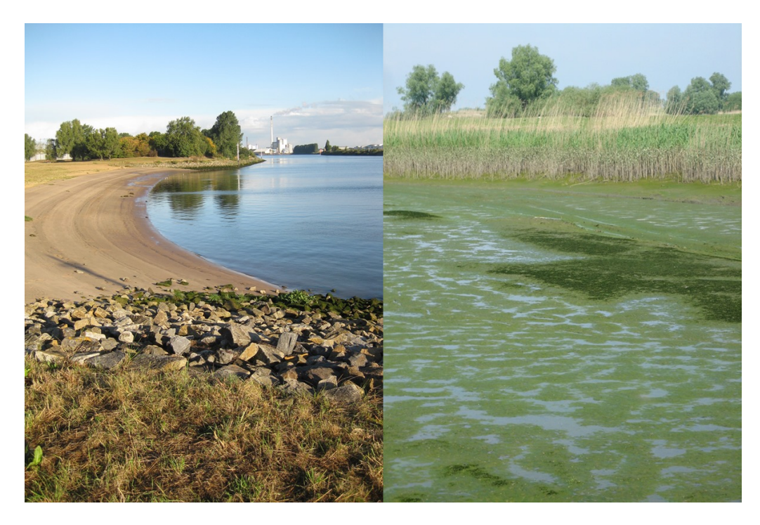
Figure 2. Left: Small restoration measure of estuarine embankment (Weser); Right: Tidal flats: a highly productive habitat.