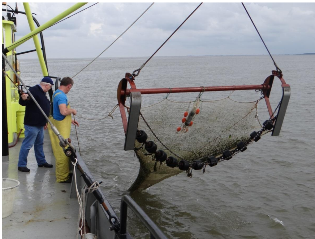
Figure 5. The 3 m beam trawl deployed in the Dutch Demersal Fish Survey (Photo:

The beam trawl surveys (Figure 5, Figure 6) revealed a general decline among marine juvenile species since the 1980s, uniformly across all areas ( Annex 2 ). As an exception tub gurnard increased in nearly all areas since 2000. Trends in estuarine resident species were much more variable, both between areas and species ( for trend plots see Annex 3 ).