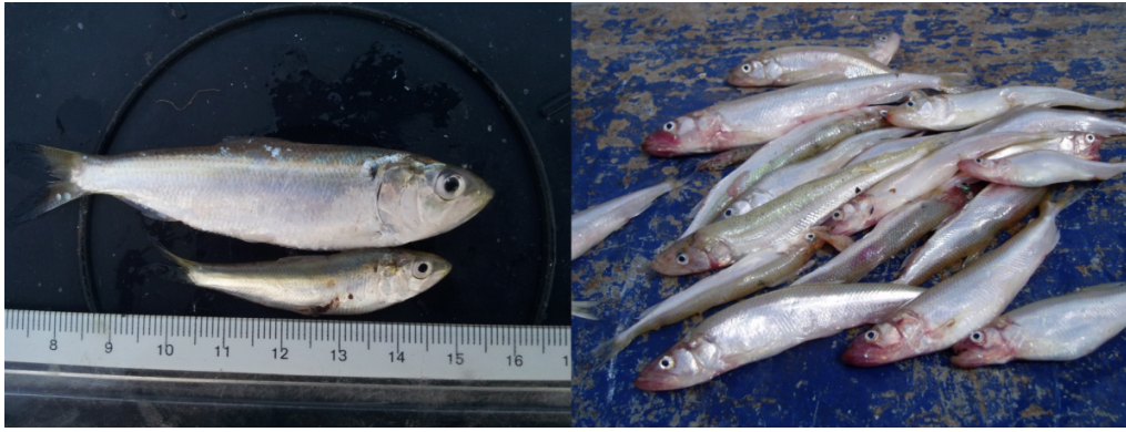
Figure 10. Left (A): Twaité shad ( Alosa fallax ) adult (above) and juvenile (below) caught in the Weser; Right (B): Smelt ( Osmerus eperlanus ) caught in the Weser (Photos: S. Schulze, Bioconsult).