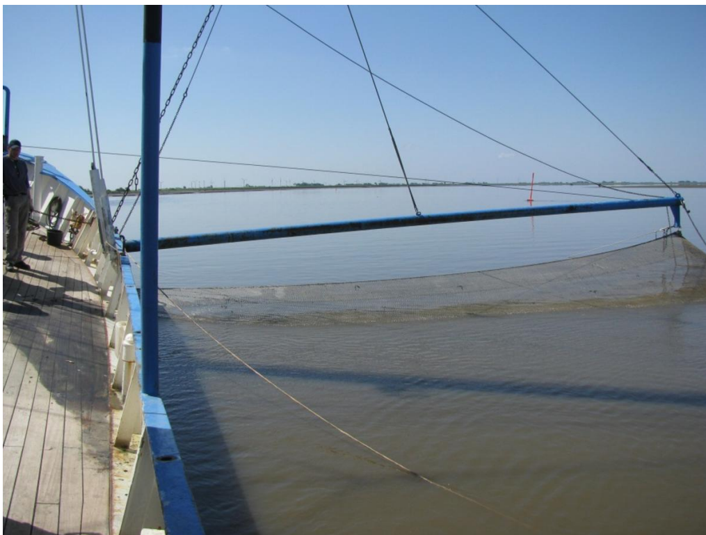
Figure 8. Stow net fishery on the Ems estuary.