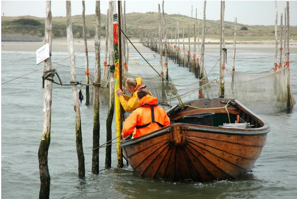
Figure 7. Daily emptying of the NIOZ fyke at the southern tip of Texel in the western Dutch Wadden Sea.