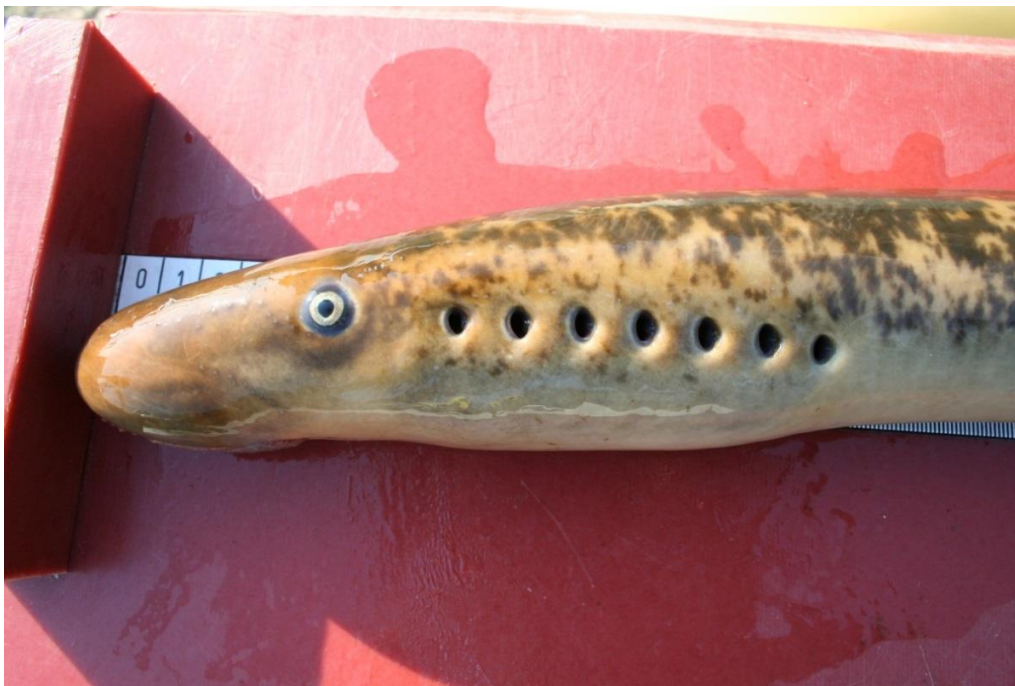
Figure 9. Sea lamprey.

Pilchard was only caught in the fykes. Catches were highly variable and trends were uncertain in both time-series.