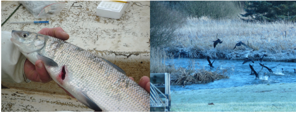
Figure 13. Left (A): North Sea houting with wounds, probably caused by cormorant attacks; Right (B): Cormorant attacks (Photos: Niels Jepsen, DTU Aqua).

The suite of potential factors underlying the observed trends and especially the decline of the marine juveniles also include factors such as habitat change (dynamics in the availability of mussel beds and eelgrass fields), sand nourishments along the coast and North Sea fisheries on adult populations. In several studies correlations between such factors and fish trends were explored but cannot satisfactorily pinpoint the cause of observed trends (Tulp et al., 2008; van der Veer et al., 2015). To identify drivers for developments for certain species, a species specific approach is necessary in which knowledge on physiological and habitat requirements are crucial.